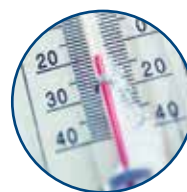
LOW TEMPERATURE PERFORMANCE