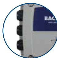
MULTIPLE CABLE GLANDS