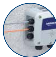
EASY TO WIRE